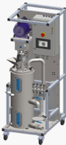
AWILAB DIGESTER „STAND ALONE“